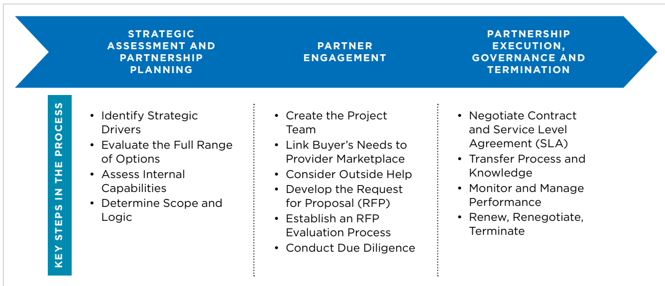
FIGURE 1: THE FAO LIFECYCLE

As shown in Figure 1 , the FAO lifecycle is a variation of the Strategic Partnering Process presented in the Strategic partnerships: Applying a six-step process: Guideline . As described in this document, outsourcing represents one of several types of contractual agreements, and a contractual agreement represents one of three types of strategic partnerships (the others being equity investments and joint ventures).