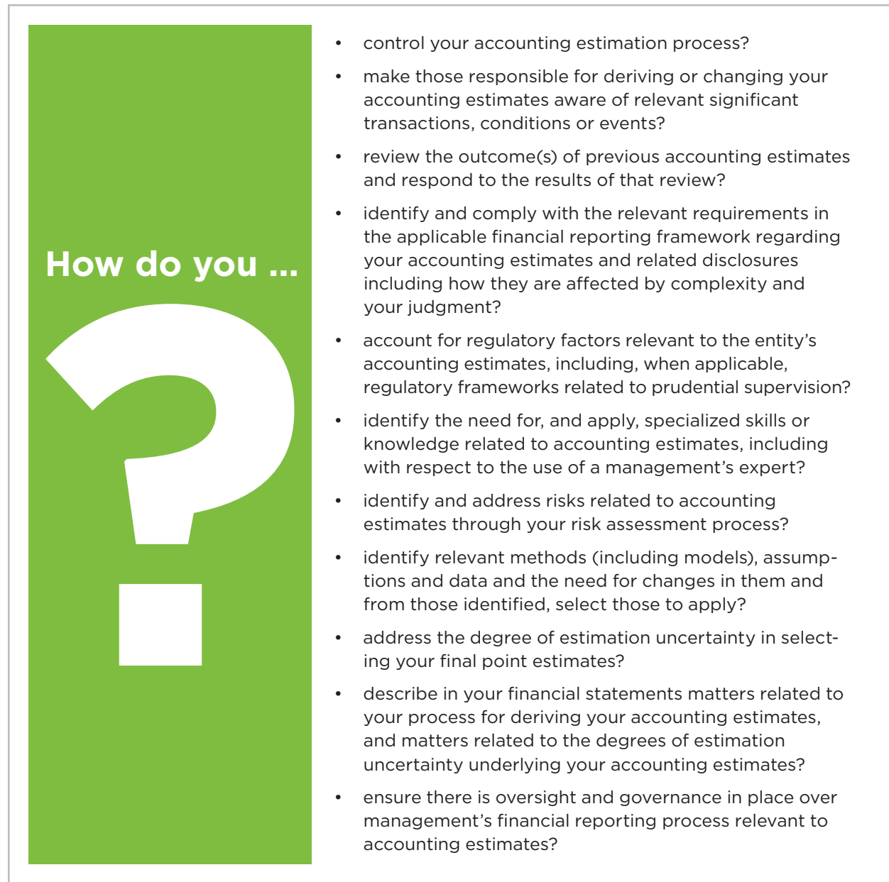
FIGURE 2 - BROAD QUESTIONS

Figure 2 sets out broad questions the auditor is likely to ask to obtain or confirm understanding of, and whether there have been changes to, key aspects of your process for deriving accounting estimates.